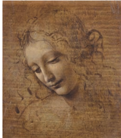
Left: One of the most famous manuscripts of Codice Atlantico created by Leonardo da Vinci in 1485. Right: "The Lady with Disheveled Hair" created by Da Vinci in 1490. — Ti Gong